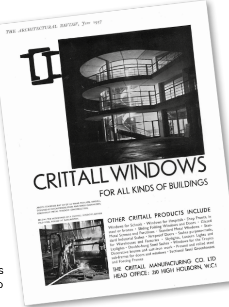
A 1930s Crittall advert

Today, Crittall is synonymous with the modernist movement. Crittall's development of the 'Fenestra' joint (in which two glazing bars intersect) in the early 1900s revolutionised steel production by strengthening the steel and enabling slimmer glazing bars. This paved the way for the development of their iconic horizontal units in the 1920s, which