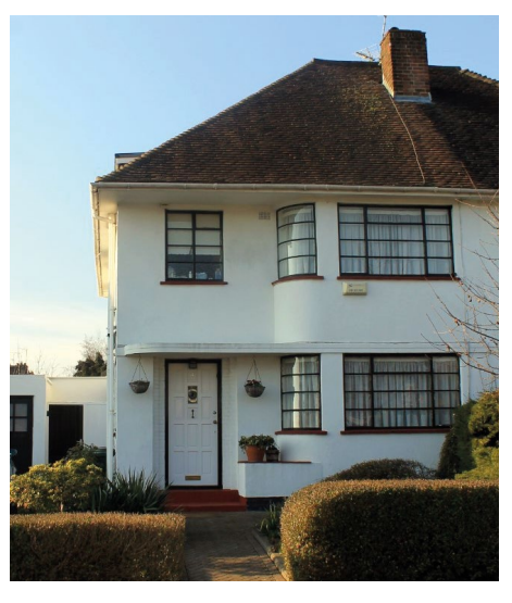
Example of steel windows in Hutchings Walk

Crittall's rapid expansion in the mid-1920s pushed its then director Francis Crittall to establish a new town, 'Silver End', south-east of Braintree. Begun in 1926, Silver End was an Art Deco settlement that housed the full range of Crittall employees. Francis Crittall, known to his workmen as 'The Guv'nor', lived at the largest house in the village. Designed by architects such as Thomas Tait and C. H. B. Quennell, it is perhaps the only modernist model village in British history. Its defining feature was, of course, its proud and expressive steel windows.