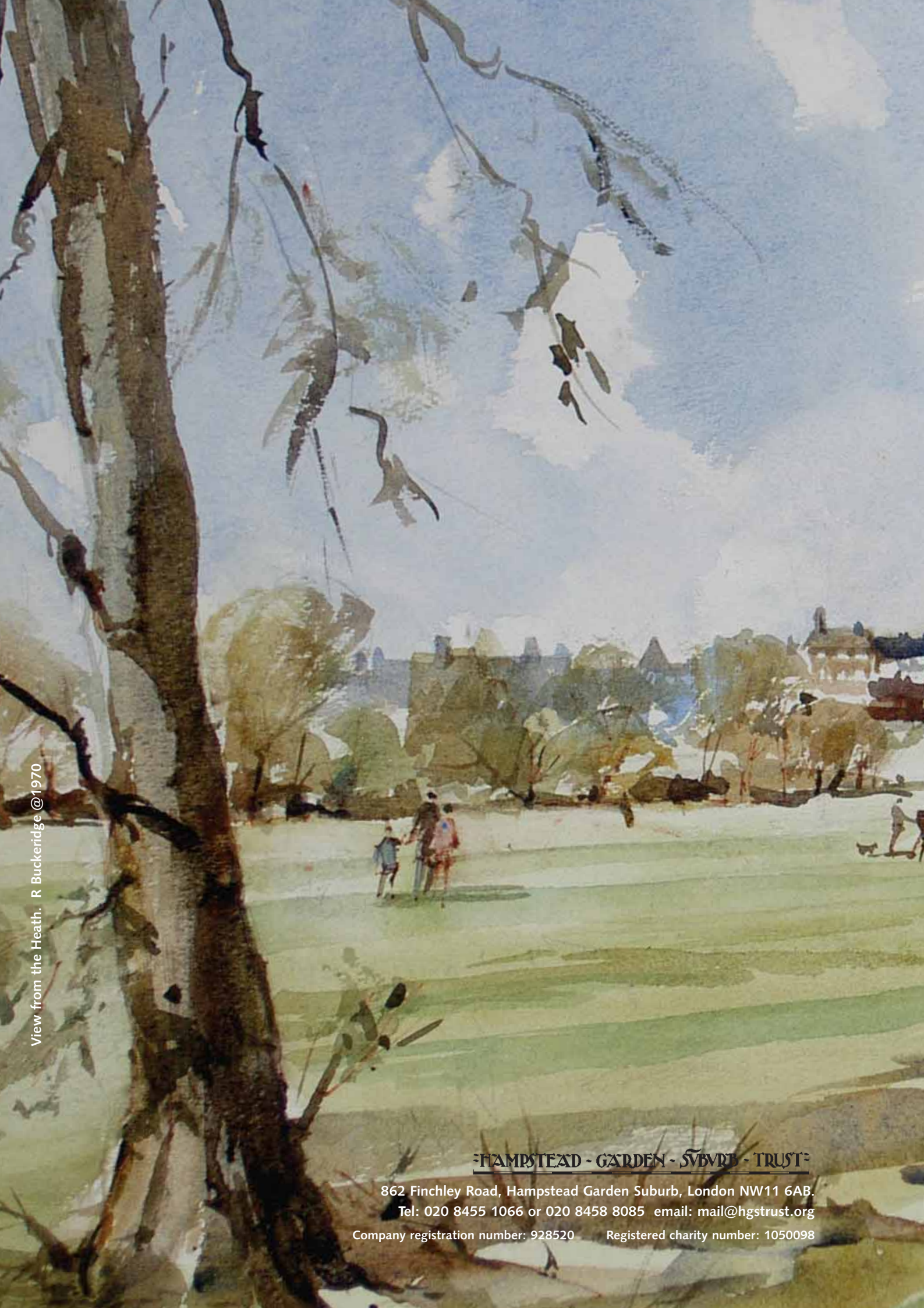
View from the Heath. R Buckeridge ©1970