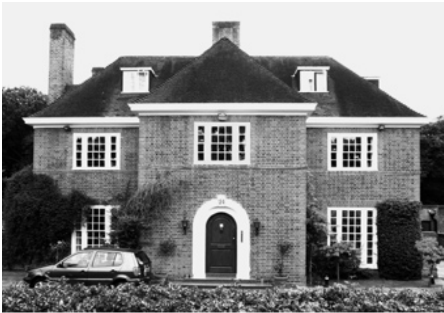
Ingram Avenue house threatened with demolition