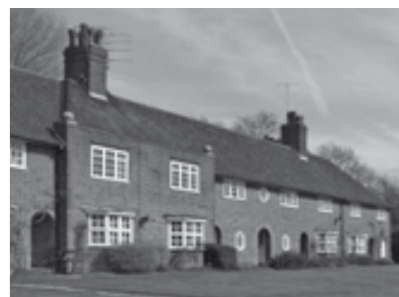
Hill Top Maisonettes