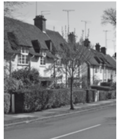
On the Suburb