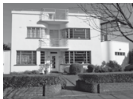
Modernist styling in Lytton Close