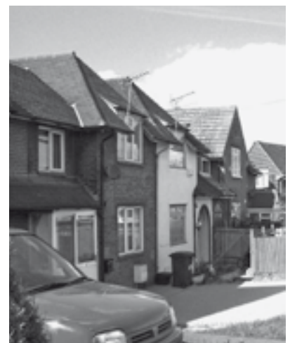
Outside the Suburb