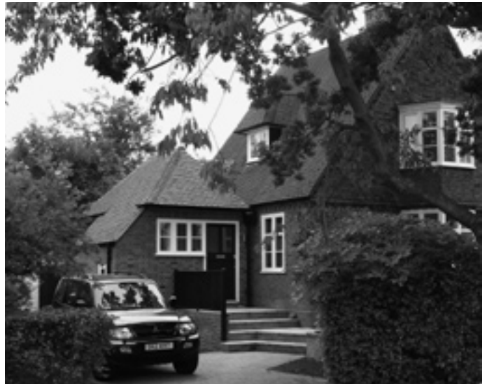
Hogarth Hill. Before and after – an unsightly garage replaced with an attractive extension.

The outlook from gardens is terribly important. In my experience, it is one of the things people value most and where feelings run highest when planning applications are submitted.