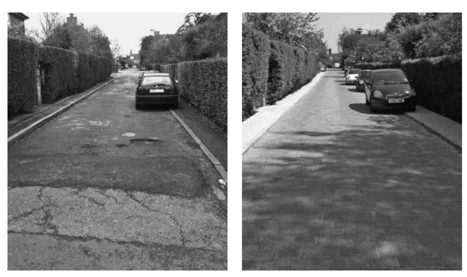
Linnell Drive before (left) and after (right) reconstruction

As well as managing the Suburb through the Scheme of Management, sometimes it is necessary to use the force of the Trust's legal powers, whether through clauses in the leases or through the restrictive covenants placed on each freehold property. Where appropriate the Trust will either assert or defend its rights and duties through solicitors and when necessary through the courts. There have been three major court actions this year. The Trust has been successful in one and expects to be successful in the two which are ongoing.