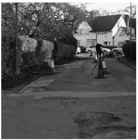
Above, Farm Walk before repair and after, below

The Trust has put the contract for the upkeep of the open spaces which it maintains out to competitive tender. This means that costs are clearly identified for each area and residents can be assured that charges are fair and competitive. In the past some residents have contributed their share of the upkeep and others have not – sometimes simply because they have not been asked. Halting the drain placed on the Trust's reserves (which used to result from the Trust bearing